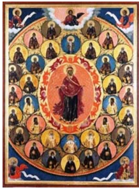
Icon of Some Saints of Mt. Athos

At that time, as Jesus walked by the Sea of Galilee, he saw two brothers, Simon who is called Peter and Andrew his brother, casting a net into the sea; for they were fishermen. And he said to them, "Follow me, and I will make you fishers of men." Immediately they left their nets and followed him. And going on from there he saw two other brothers, James the son of Zebedee and John his brother, in the boat with Zebedee their father, mending their nets, and he called them. Immediately they left their boat and their father, and followed him. And he went about all Galilee, teaching in their synagogues and preaching the gospel of the kingdom and healing every disease and every infirmity among the people.