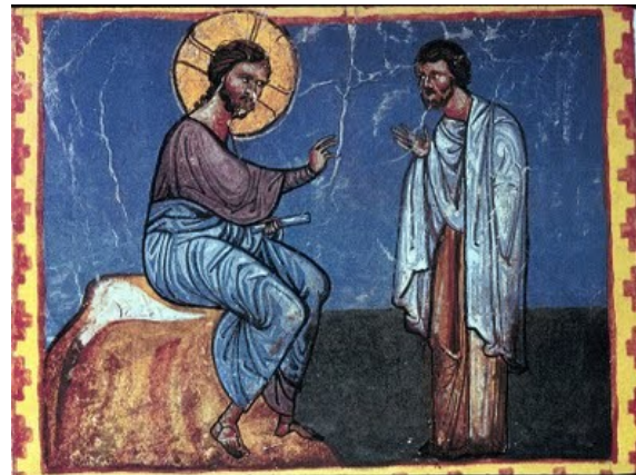
Christ and the Rich Young Ruler

St. Cosmas Aitolos once said, "I have need of one hundred grams of bread a day, and God blesses it. He blesses those hundred grams, but not one gram more. So, if I take 110 grams, I have stolen 10 grams from the poor." Those are very strong words! If we carefully apply this to ourselves, we'll see that we fail the test again and again and again. Most of us don't have this kind of faith. We don't trust in God nearly enough. But, we can start with something basic. As much a part of the Christian life as fasting and prayer, is giving of our substance to God. It's as important as prayer. It's as important as fasting, because it's commanded by God. Our Lord said in the Gospel: "... woe to you Pharisees! For you tithe mint and rue and all manner of herbs, and pass by justice and the love of God. These you ought to have done, without leaving the others undone. If we don't freely and thankfully give to God, we're not even fulfilling the minimum commandment of Christ. It's the same as fasting, as saying our morning and evening prayers: these are minimums. If we're not even doing the minimums, we're in grave spiritual danger. We must freely give of our substance to God, to His Church.