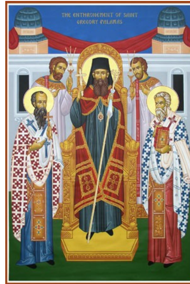
THE ENTHRONEMENT OF ST. GREGORY PALAMAS

O light of Orthodoxy, teacher of the Church, its confirmation, O ideal of monks and invincible champion of theologians, O wonder-working Gregory, glory of Thessalonica and preacher of grace, always intercede before the Lord that our souls may be saved. (Troparion, Tone 8)