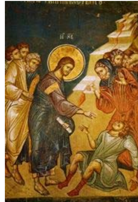
Jesus Heals the Epileptic Boy