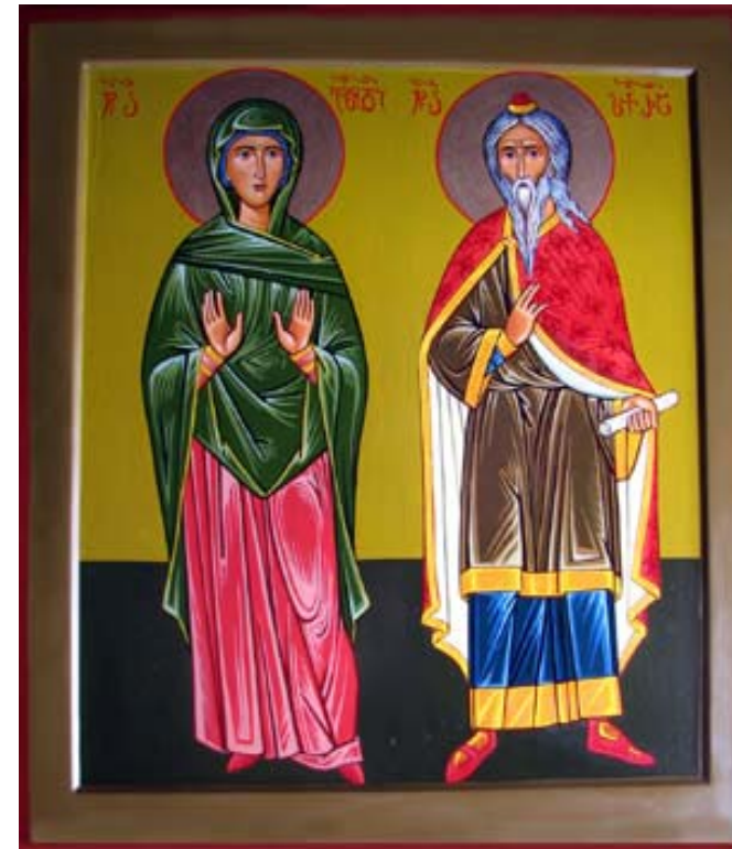
SS. Zachariah and Elizabeth Parents of St. John the Forerunner

"In the vesture of a priest, according to the Law of God, thou didst offer unto Him well-pleasing whole-burnt offerings, as it befitted a priest, O wise Zacharias. Thou wast a shining light, a seer of mysteries, bearing in thyself clearly the signs of grace; and in God's temple, O wise Prophet of Christ God, thou wast slain with the sword. Hence, with the Forerunner, make entreaty that our souls find salvation. "