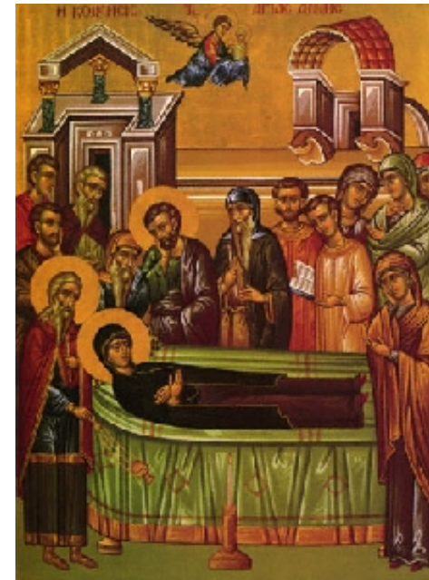
The Dormition of the Righteous Anna

According to tradition, Anna, the ancestor of God, lived for sixty-nine years, and her spouse Joachim, for eighty; according to one account, Saint Joachim died two years before Saint Anna. The Theotokos had been orphaned of both her parents already when she was eleven years of age, when she was living in the Temple (see Sept. 8 and Nov. 21). Saint Anna is invoked for conceiving children, and for help in difficult childbirth. She stands in the line of those whose faith and life prepared the way for the birth of Christ God. She, Joachim, and the Holy Theotokos are examples of complete surrender to the will of God. They are examples of selflessness in submitting their own needs and wants for a greater purpose. It was that submission that kind of surrender that won for us the Savior of the world.