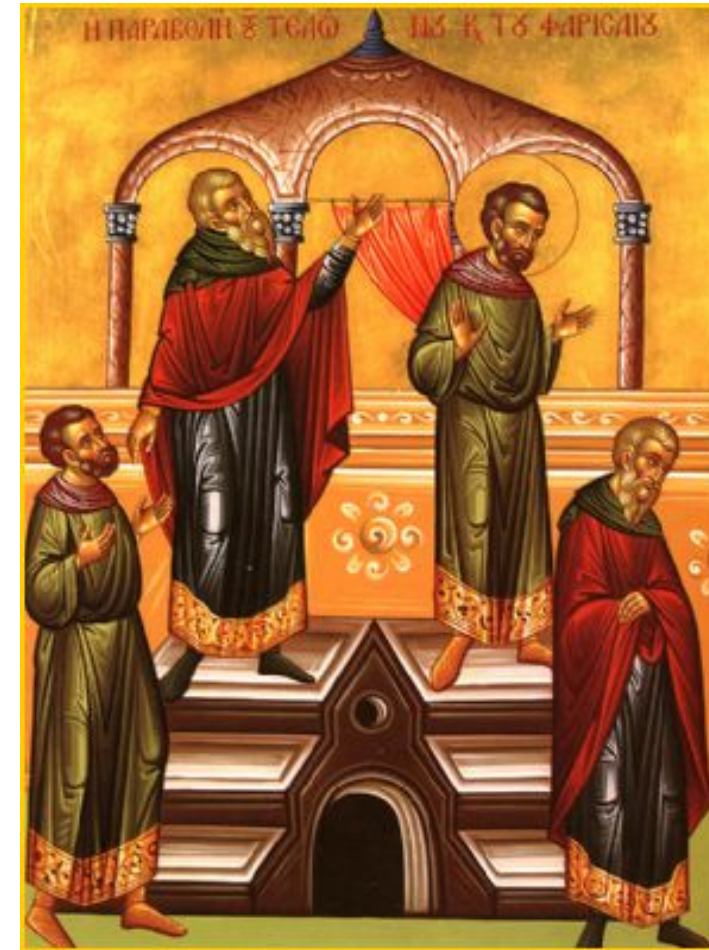
ICON OF THE PUBLICAN AND PHARISEE