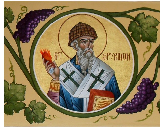
OUR HOLY FATHER ST. SPYRIDON THE WONDERWORKER BISHOP OF TRIMYTHOUS

O Father, God-bearer, Spyridon, you were proven a champion and Wonder Worker of the First Ecumenical Council. You spoke to the girl in the grave and turned the serpent to gold. And, when chanting your prayers, most sacred One, angels ministered with you. Glory to Him who glorified you; glory to Him who crowned you; glory to Him who, through you, works healing for all.